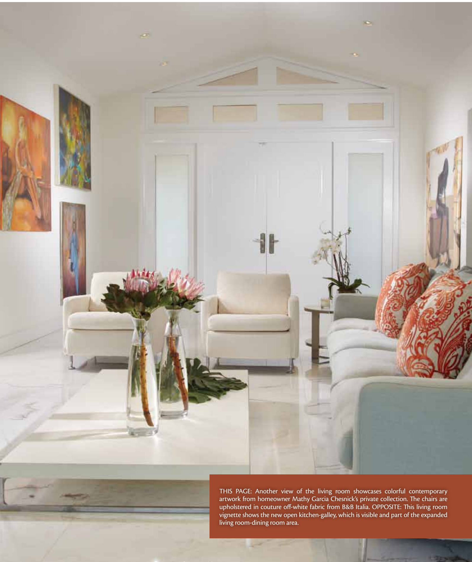
THIS PAGE: Another view of the living room showcases colorful contemporary artwork from homeowner Mathy Garcia Chesnick's private collection. The chairs are upholstered in couture off-white fabric from B&B Italia. OPPOSITE: This living room vignette shows the new open kitchen-galley, which is visible and part of the expanded living room-dining room area.