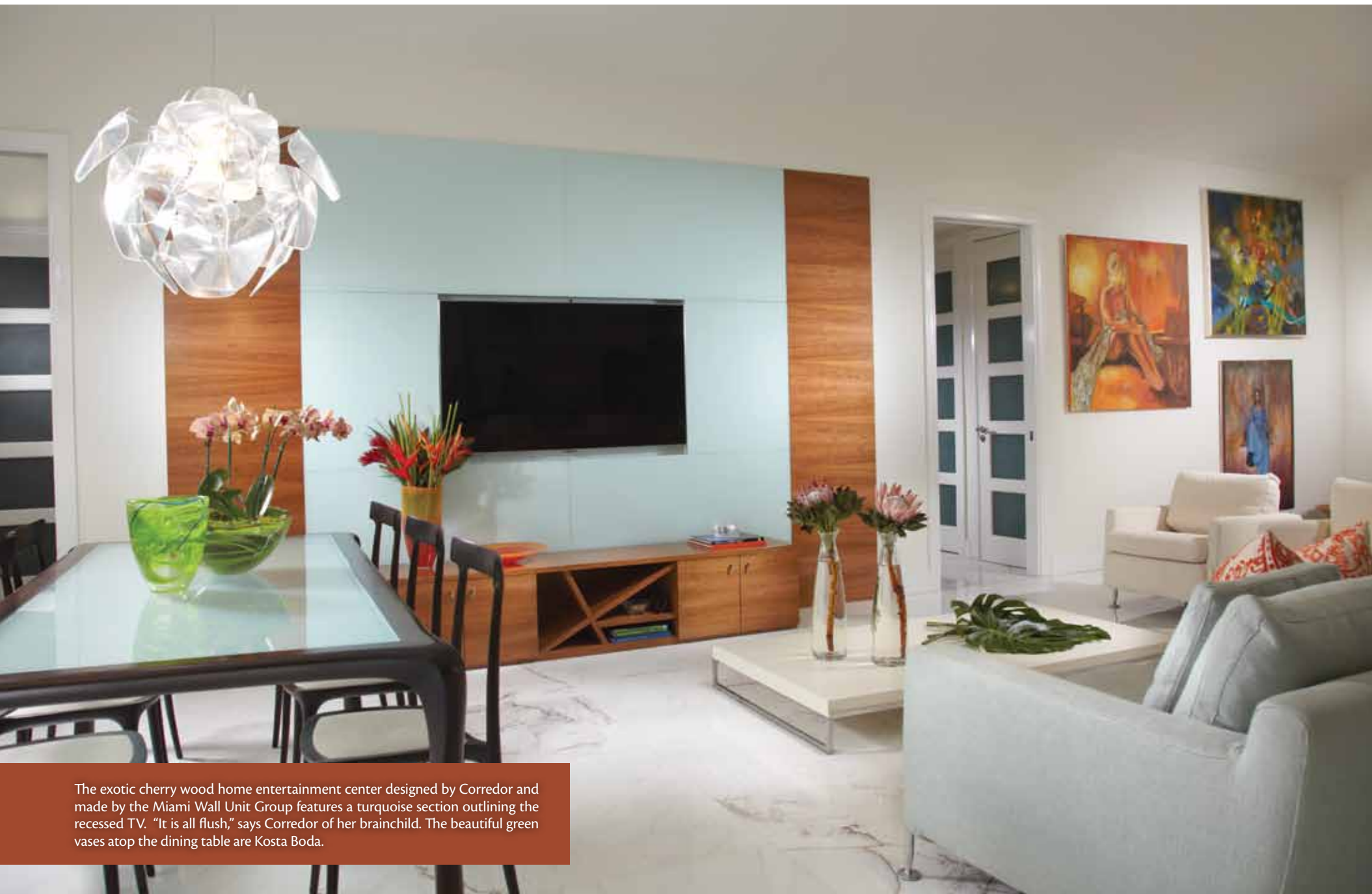
The exotic cherry wood home entertainment center designed by Corredor and made by the Miami Wall Unit Group features a turquoise section outlining the recessed TV. "It is all flush," says Corredor of her brainchild. The beautiful green vases atop the dining table are Kosta Boda.