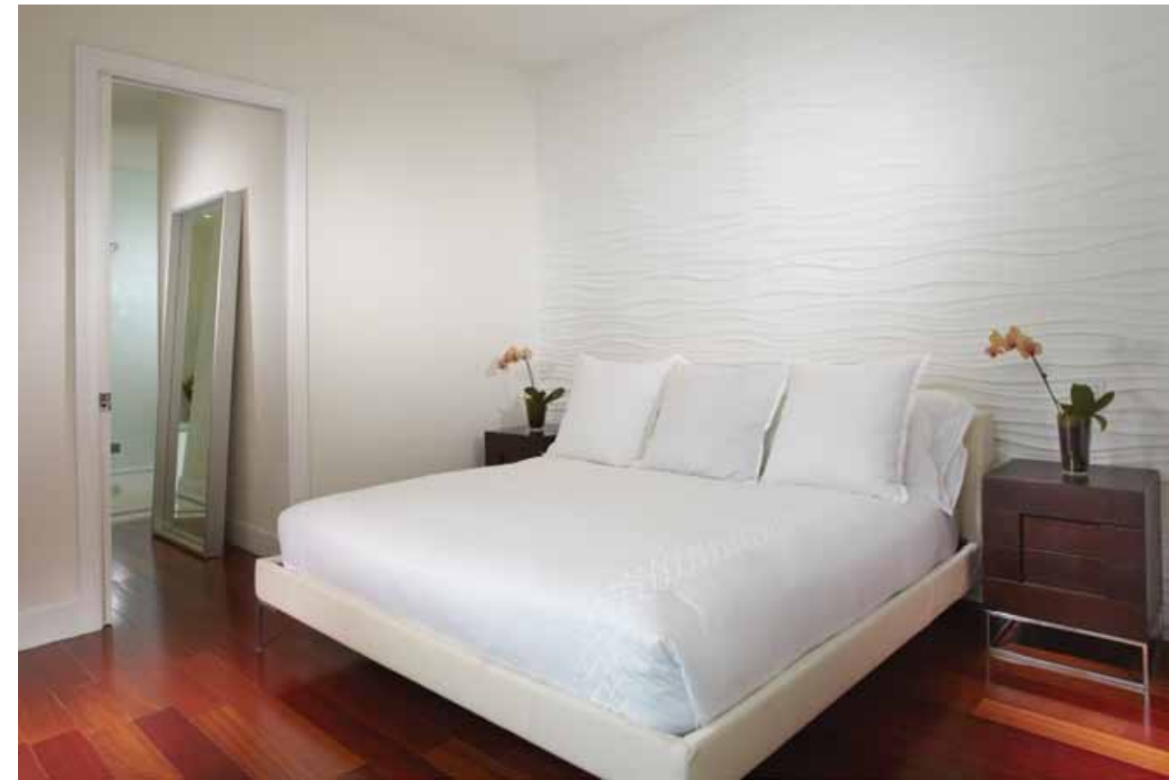
ABOVE: Filled with Miele appliances and white Italian-made cabinets with recessed handles, the open kitchen-galley is a favorite gathering place for the couple and their two children. OPPOSITE TOP: The master bedroom with a king-size bed and white linens presents perfect cherry wood floors. "Mathy and Andrew like the room spartan, and it maximizes the space," says Corredor. RIGHT: The master bath is highlighted by frosted green glass and a cherry wood cabinet with double sinks, designed by Corredor. A peek-a-boo window brings the landscaping inside. The floor is pure marble. OPPOSITE BOTTOM: The powder room was modernized with a white linear glass wall and pedestal sink executed in a modern square. Sidewalls are pebbled white glass.

from the living and dining space. It's also great for entertaining friends and business associates. They can get a real feel for the subtropical elegance of Miami."